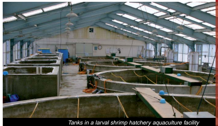
Tanks in a larval shrimp hatchery aquaculture facility

Similarly, the National Institute for Nutrition and Seafood Research (NIFES) has collaborated with the Norwegian School of Veterinary Medicine, the University of Bergen, the fish feed suppliers EWOS (a division of the Norwegian company Cermaq A/S), Marine Harvest and Nutreco, to study various aspects of fish farming, including the refining of fish oils, and health aspects of seafood consumption. NIFES, which was part of the 2005 study that looked at ways to promote the use of whale products, continues to fund research on whale oil. 32