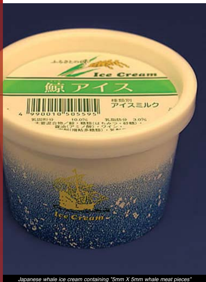
Japanese whale ice cream containing "5mm X 5mm whale meat pieces"

Like Norway, Japan has invested heavily in research into uses of marine bi-products in fish feed. A 1996 study published in the Japanese Journal of Aquatic Food Production references the use of whale oils, including, "sperm oil, sei whale, humpjack [sic] whale, fin whale and blackfish [pilot whales]" in fish feed, and recommends mixing dry pellets with oils in order to administer drugs for fish disease. 35 A patent for the feed was sought by Takeda Corporation's animal health division in 2001, and a US patent was issued in 2003. 36