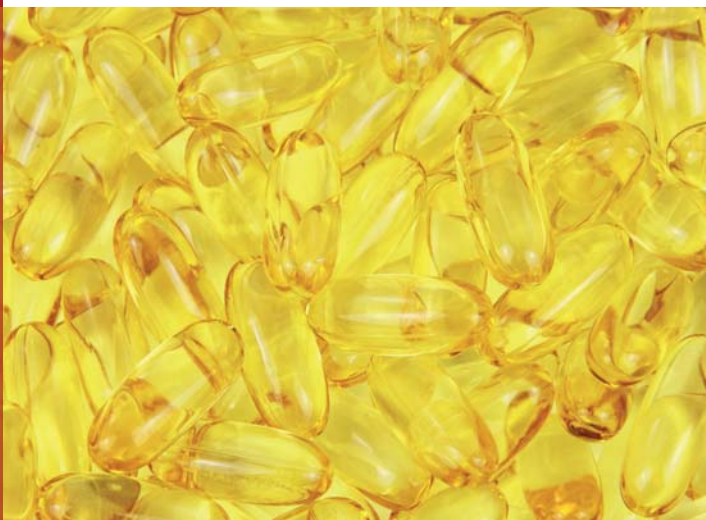
Norway is a major player in the world Omega-3 market, supplying about 40% of the oils used in nutraceuticals and functional foods today.

Several of the studies have now reached clinical trial stage and at least one, conducted at the University of Bergen in conjunction with Haukland University Hospital in 2009, has concluded that whale oil is "more effective than other Omega 3s (such as cod liver oil) in reducing the severe inflammation associated with Rheumatoid Arthritis" (RA). 8 Like Norway's seal oil research, the study (which was open to patients from the USA 9 ) was funded by various Norwegian government agencies such as the National Institute of Nutrition and Seafood Research (NIFES) as well as the GC Rieber Foundation, part of GC Rieber, a leading global supplier of Omega-3 oils, cod liver oil and animal feed.