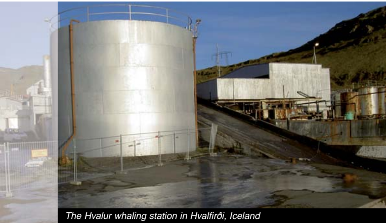
The Hvalur whaling station in Hvalfirði, Iceland

Iceland was an exporter of whale meal and oil as well as meat and blubber through the 1980s 25 , including meal for use as animal feed produced by Hvalur hf, Iceland's fin whaling company. 26 Considering that Iceland's population is less than 318,000, and whale meat is consumed on a limited basis, its whaling industry must have stockpiled thousands of tonnes of meat and blubber from the recent expansion of its whale hunts (quotas increased to 200 fin and 200 minke whales a year from 2009), even taking into account its growing exports under its CITES reservation (see box).